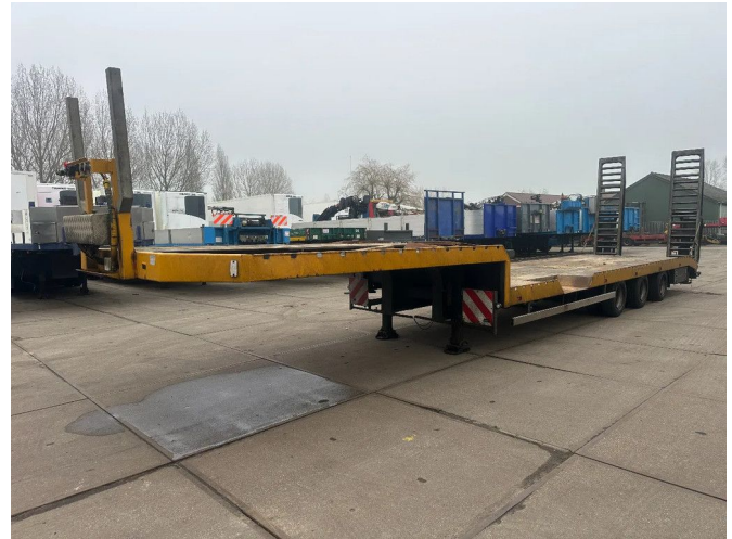
HRD 3 AXLE, HYDRAULIC RAMPS, LAST AXLE STEERING