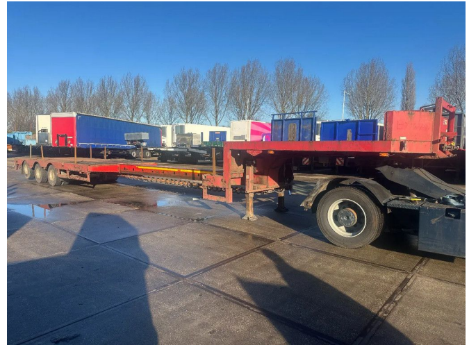
Broshuis 2 AXLE, EXTENDABLE 5 METER