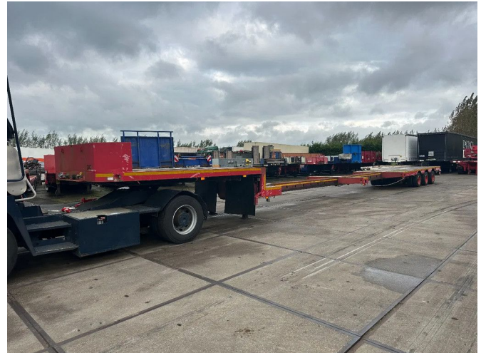
DEN OUDSTEN TRAILERS 3 AXLE FORCED STEERIND 2 X...