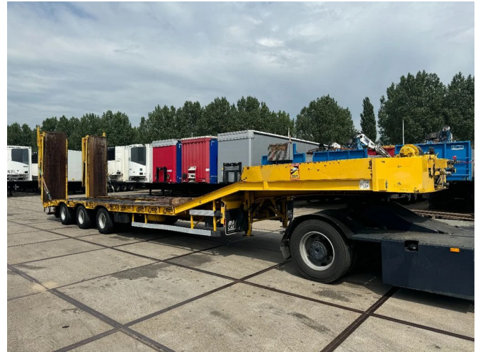
Castera 3SS 34 T 3 AXEL