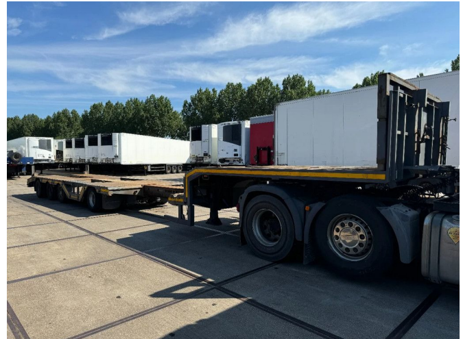
Floor 4 AXLE, 3,15 M EXTENDABLE, WIELKUIP EN GIEKSL...