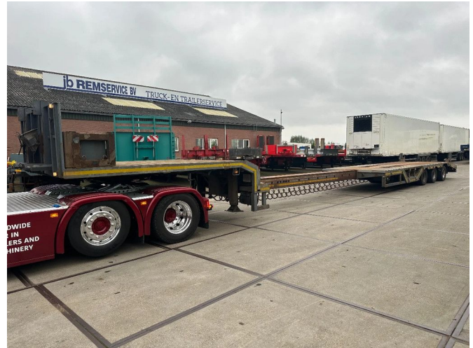
Floor 3 AXEL, 6 M EXTENDABLE, WHEEL FILLS