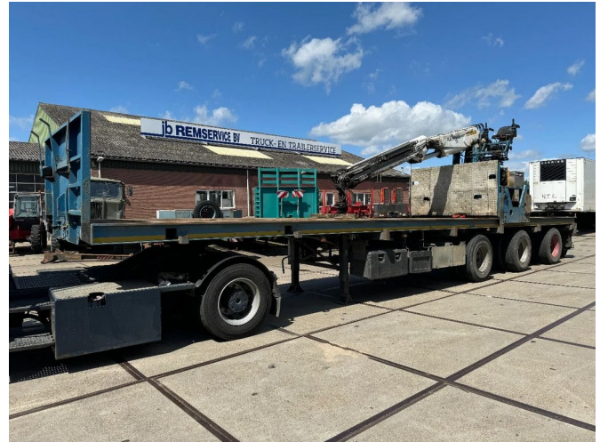
Floor FLO 17 30 H2 + KENNIS R-36 DRUM BRAKES