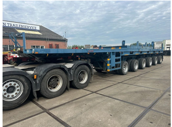
Nootboom 6 AXEL 102 TON