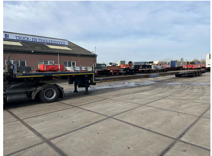
Nootboom DOUBLE EXTENDABLE, TOTAL 26.53 METERS