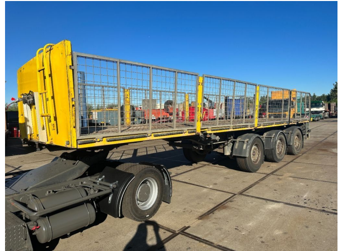
LAG O-3-39-LS 10,85M