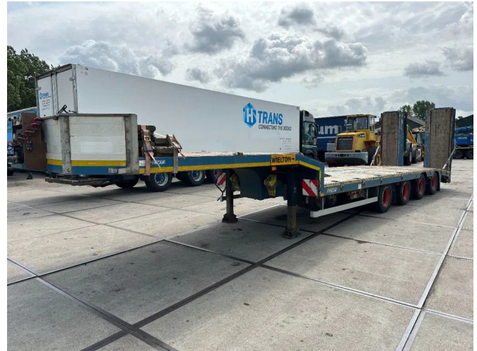
Wielton 4 AXEL WITH RAMPS